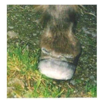
The picture on the right shows a newly trimmed hoof: this is the correct shape and balance for a donkey!