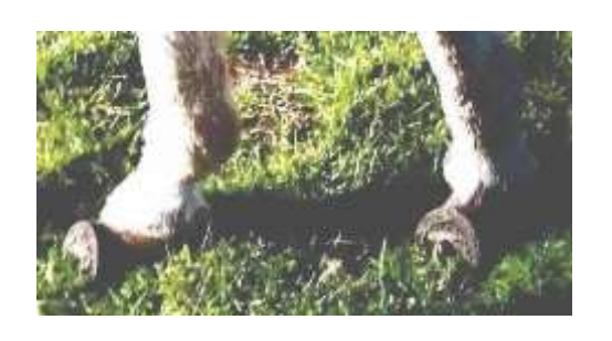
Hooves should NEVER be sawn off or trimmed by an amateur.